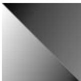
bevelled extra clear