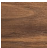
NC walnut canaletto